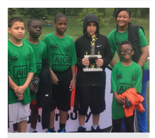
Rugby is not only fun and competitive—it helps promote leadership and teamwork skills among our kids and challenges them with rigorous physical movement and activity.