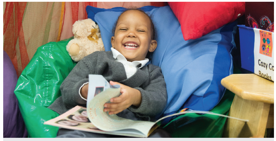
Our Cozy Corners are equipped with books, photos of our kids' family members, and cushions in calming colors and materials.