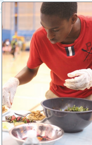
Healthy Harlem Cook-off

The hub of our efforts to promote widespread well-being is the Harlem Armory, a 50,000-square-foot athletic facility on 143rd Street. The Armory hosts our HCZ teams and intramural leagues; gives our students the chance to play sports such as tennis, soccer, golf, basketball, gymnastics, baseball, softball, volleyball, lacrosse, and track and field; and features a climbing wall, a batting cage, and free community fitness and cooking classes. The northern anchor in the HCZ network, the Armory also serves as the endpoint of our peace march. This year, after marching 4,000 strong through the streets of Harlem for our 21st annual Children’s March for Peace, students, parents, staff, and residents poured into the space for a pep rally with moving original performances devoted to this year’s timely theme—justice.