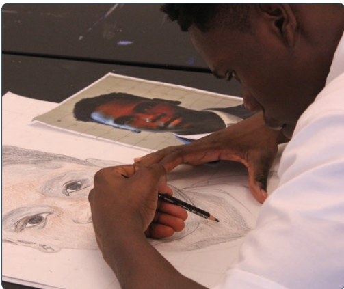
HCZ Students Are Creative...

In nurturing the whole child, the HCZ pipeline adds up to something far greater than the sum of its parts—a whole community of talented young people who share our investment in seeing Central Harlem thrive and can serve as role models for the next generation of HCZ youth.