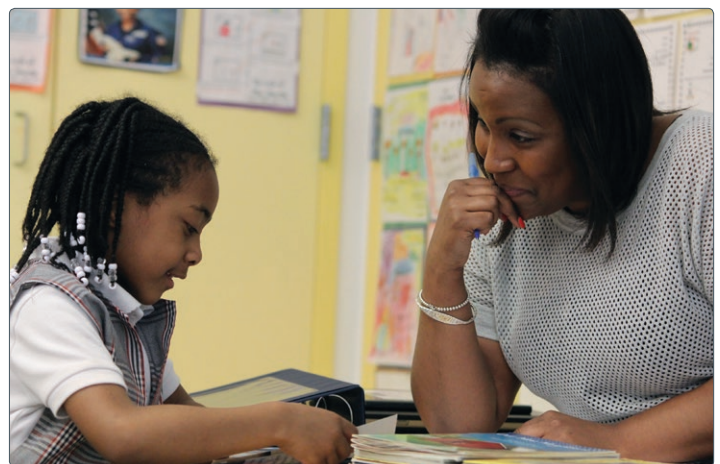
A Promise Academy Student Blossoms with Individualized Support

Swinging down to 117th Street, you would discover pre-K scholars developing hypotheses to conduct their first science experiments, while moms and dads pick out bedtime books to bring home. One block up at TRUCE®, high-school students would be finalizing the layout of the literary magazine as the film club makes edits to a new documentary and the fashion