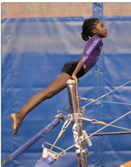
A Gymnast Takes Flight at the Harlem Armory

You would see all this and more before reaching Promise Academy II and the newly named Geoffrey Canada Community Center on 125th Street. The middle-school chess team would be plotting their next moves, while the jazz band practices for a performance on the plaza at Lincoln Center and high-school students board a bus for a tour of college campuses. Finally, if you peek inside the gym, you would catch a glimpse of our newest group of parents graduating from The Baby College®—where the journey for our children and families begins.