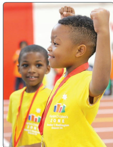
4,000 HCZ Students Brought Their Best to Summer Games

and the Healthy Harlem team gives out free produce and information about the vast range of HCZ services at our monthly Healthy Harvests in the St. Nick courtyard.