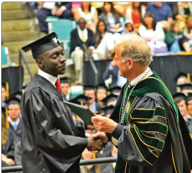
99 HCZ Students Graduated from College in 2015

This past year, we celebrated the graduation of 99 HCZ students from college—70 from 4-year schools and 29 from 2-year schools. In total, our College Success Office worked with 881 HCZ students at 207 colleges and universities across the country, providing academic and personal support, financial guidance, and career readiness workshops and services. We also helped 192 HCZ college students secure paid internships at 67 organizations, giving them an opportunity to build their resumes, make connections, and increase their competitiveness in the job market.