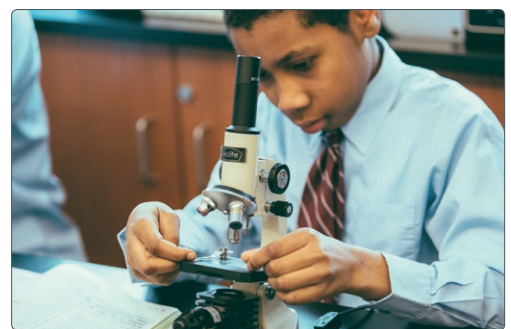
An Aspiring Scientist Trains His Focus in the Lab