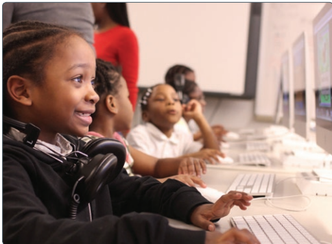
An Afterschool Student Indulges His Love of Learning

At P.S. 133 on 5th Avenue, you would find Peacemakers quizzing elementary-school students for a spelling bee, while a few blocks away at our College Success Office, staff would be busy helping our 881 college students advance toward the ultimate goal for all our 13,083 youth—college graduation. College advisors would be discussing possible majors one-on-one with advisees, while workshops on study strategies, financial literacy, and interview skills take place down the hall.