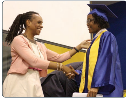
A Promise Academy Middle-School Graduate Moves One Step Closer to College

In 2015, HCZ continued to serve as a national model and prominent thought and policy leader, sharing strategies and lessons learned with educators, community organizers, elected officials, and policymakers from around the country and world. Our Practitioners Institute held workshops for visitors from 36 U.S. communities and 16 international groups and, through our partnership with the Promise Neighborhoods Institute, we continued to provide technical support and guidance to 70 U.S. communities working to replicate our model, including 48 communities that have received federal grants through President Obama's Promise Neighborhoods program. 2015 was also the second year of the President's new Promise Zones program, the most recent federal anti-poverty initiative inspired by HCZ's comprehensive, place-based approach. In April, the President announced eight new Zones to join the initial five announced in January 2014.