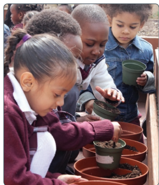
Seedlings in the HCZ Garden

2015 marked the second anniversary of our new Promise Academy I school building and community center in the St. Nicholas Houses. The building is a nucleus of activity and a valuable resource for the entire St. Nick community—teeming with nearly 1,000 students each day, plus hundreds of neighborhood children, families, and residents participating in free community classes and events on nights and weekends (see sidebar). To stand before this bright, welcoming state-of-the-art facility presiding over 129th Street as students and professionals funnel in for a day of high-quality education and hard work is to see and feel firsthand the difference that two years can make.