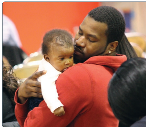
An HCZ Dad Celebrates Graduation from The Baby College