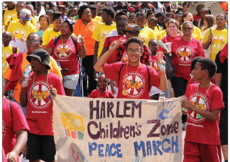
Marching 4,000 Strong at the 21st Annual HCZ Children's March for Peace

If you were to take a walk through the Harlem Children's Zone in 2016, you would see what we feel so proud and fortunate to see each and every day—thousands of young people fulfilling their amazing potential and helping to change the narrative both here in Harlem and for all our nation's children.