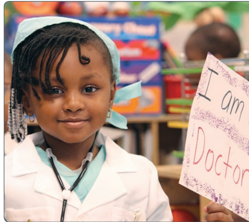
Harlem Gems Look Toward Bright Futures on “Career Day”

Partnering with parents and ensuring they receive the support, guidance, and resources they need are critical to our efforts to foster school readiness throughout our early childhood programs—The Baby College, Baby College GRADS, Three-Year-Old Journey, Get Ready for Pre-K, and our four Harlem Gems Pre-K sites. Gems parents spend time in the classroom on “Mommy Mondays” and “Father Fridays,” participate in family music, fitness, and cooking classes, and help their young scholars with homework. This past year, 99.5% of our Gems (201 out of 202) were assessed to be school-ready or better.